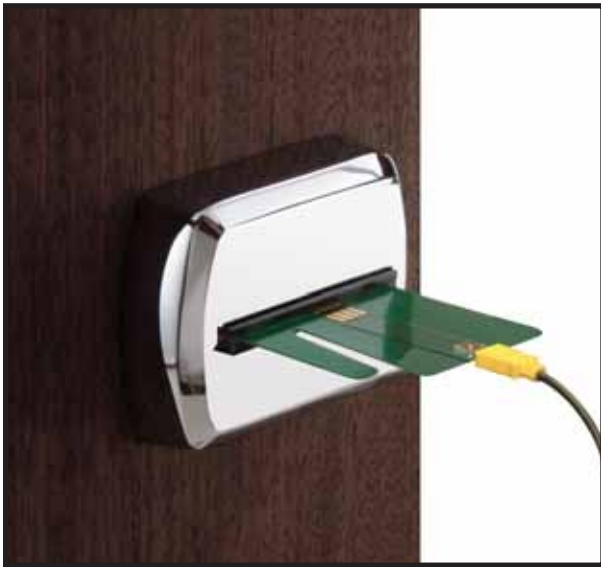
Voltmeter checking an insertion card reader lock.