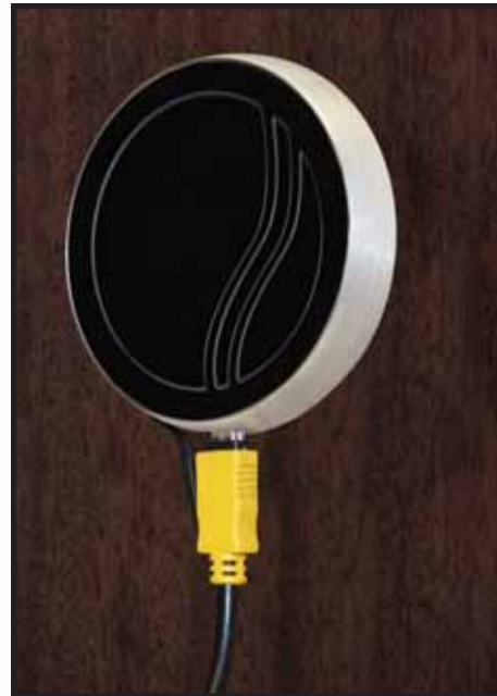
Voltmeter checking a RFID lock.