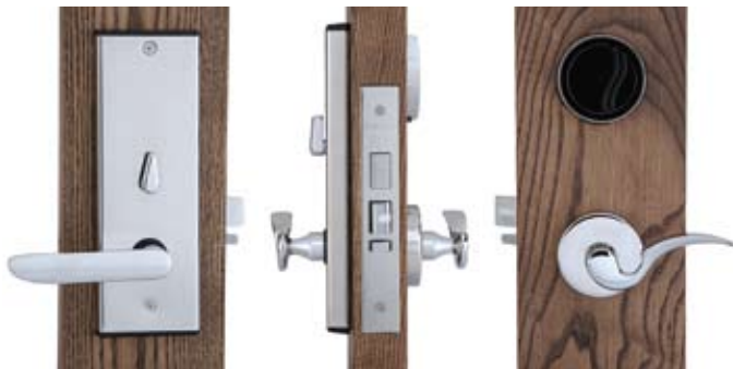
Quantum MT RFID