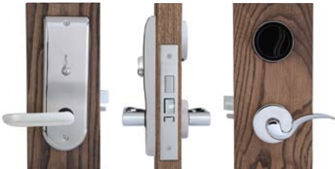
Quantum ädäsē RFID