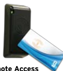
Remote Access Controller