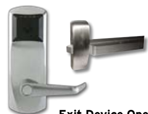
Exit Device Operator