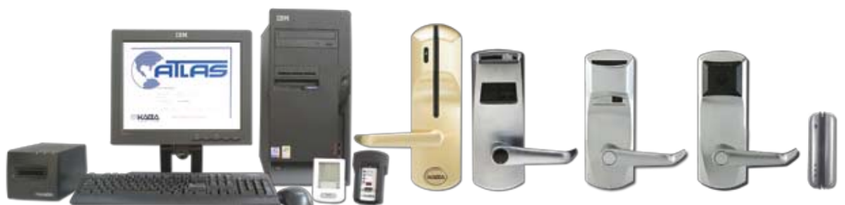
The ATLAS system