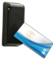
RAC Remote Access Controller