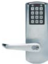
E-Plex 2000 Pushbutton Lock