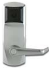
790 Contactless Electronic Lock

ILCO provides economical, reusable custom-designed keycards plus do-not-disturb signs, card holders, and cleaning. All manufactured under stringent ISO guidelines to meet ABA specifications.