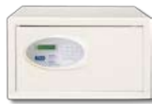
Electronic In-Room Safes