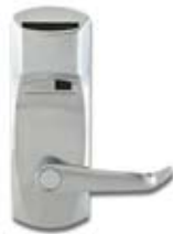
770 Electronic Lock